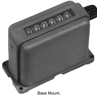
Base Mount, Knob Reset

A rugged workhorse . . . with proven extra reliability for demanding industrial applications